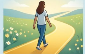
Aligned her life with it