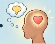
Meditated on it